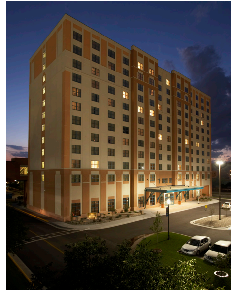
On the bank of the Mississippi River, the Isle Casino Hotel Bettendorf will be this year’s convention location.

Additionally, during the National Grange convention, attendees can learn more about the program by visiting