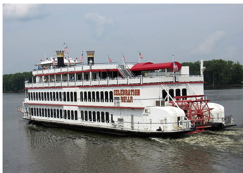
The Celebration Belle riverboat will welcome convention attendees onboard for the Host Banquet on Monday, November 11.

"The team is working to build a schedule for workshops that appeal to Grange members of all ages, experience, and backgrounds - with ideas that can be used in programs, and some workshops that are simply for fun," said Edelen.